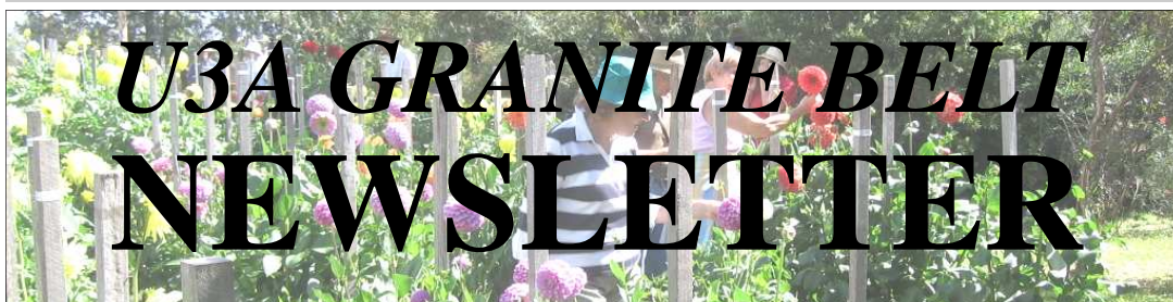
Above: U3A Garden Club at Burnell's