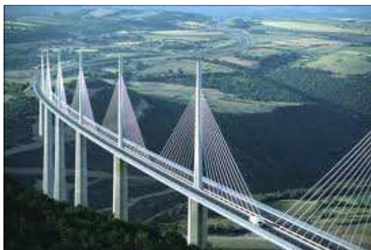
Left: Millau Bridge, France

This time we utilized the internet in situ, a great way to learn even more about and see the structures that had been chosen. Of course, in true Dromomaniac fashion, we now want to visit all of these wonderful