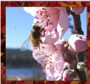
Spring in Stanthorpe